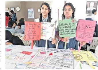
COVA in collaboration with ICAN organised 13th annual display of project works on social issues on Tuesday.

Topics selected for the projects works included right to civic services through citizens' charters, environmental health and problems faced by government schools and other social issues. Around 750 students were selected from 20 schools and submitted 70 projects.