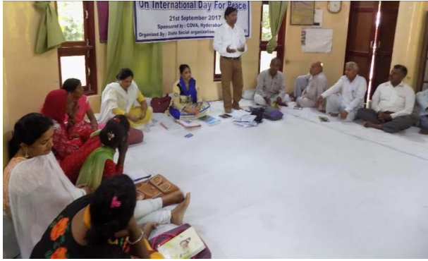
Prayers for Peace @ Saharanpur