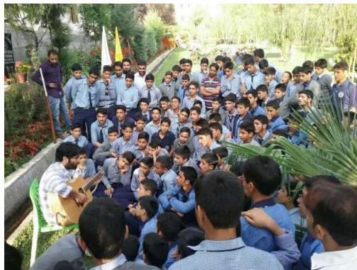
Songs for Peace @ Srinagar