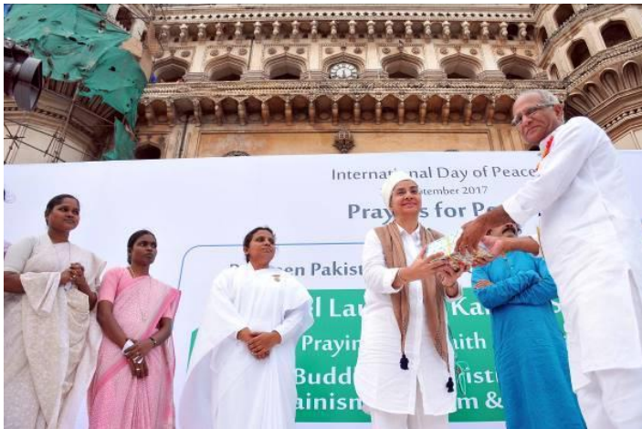
Prayers for Peace @ Charminar, Hyderabad