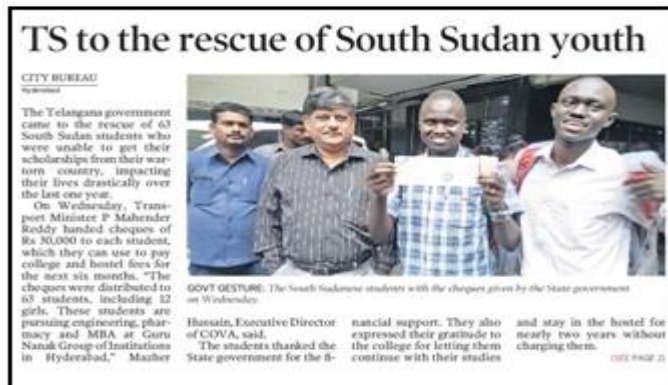
A Newspaper Story on release of Scholarship Cheques to students of South Sudan

Sixty three students from South Sudan aged between 20 & 25 years and studying Engineering and B. Pharmacy in Guru Nanak Group of Institutions in Hyderabad are paying a very heavy price for the civil war that has erupted in their country since 2014 and were facing threat of discontinuation of studies and starvation. These students were provided full scholarship for higher education by Government of South Sudan in 2014. However as civil war broke out in South Sudan and there is no functional government in their country, they have not receive any scholarship after a small initial payment in 2014.