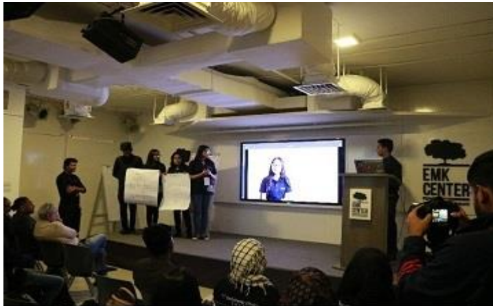
A TechCamp in progress in Dhaka, Bangladesh

Taking advantage of a strong and enthusiastic pool of over 400 trained partners and trainers in different TechCamps, COVA has started COFI Networks in different cities where the TechCamps were organised under the banner of COFI (Cyber Operations for Fraternity and Integration) Networks International with Chapters in different cities. Members are active in dedicated WhatsApp Groups and Facebook Group. Meeting of the Local COFI Networks have also started in different cities.