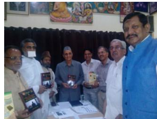
Book release on Hindu-Muslim Unity and Peace