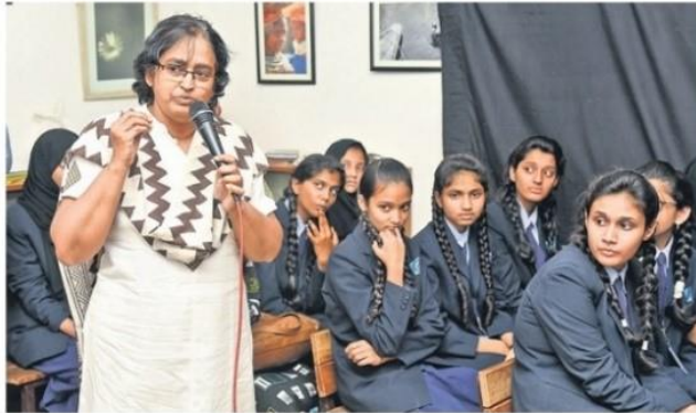
VOICING CONCERNS: Participants at Art for Peace programme in Lamakaan on Saturday.