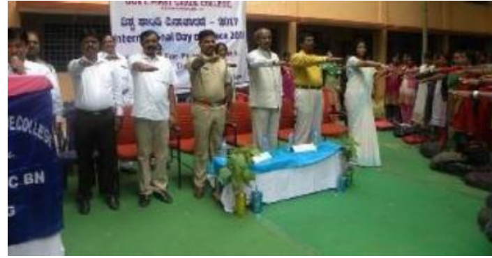
Prayers and Pledge for Peace @ Bengaluru