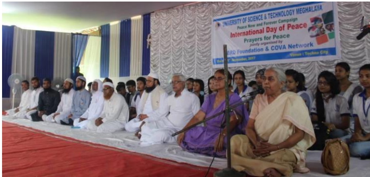
Prayers for Peace Meeting at USTM @ Meghalaya

As 21st September is declared as International Day of Peace by the United Nations, Prayers for Peace Programs were organized on this day in Hyderabad, Bengaluru, Manipur, New Delhi, Saharanpur and Srinagar in India and Karachi in Pakistan.