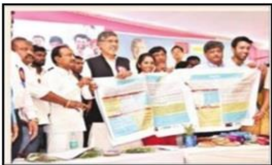
Release of Poster by Kailash Satyarthi and others