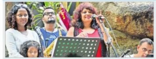
యూవారు జరిగిన కార్యక్రమంలో పాఠ్ లు పాదుతున్నారు..