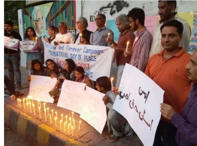
Prayers for Peace @ Lahore, Pakistan