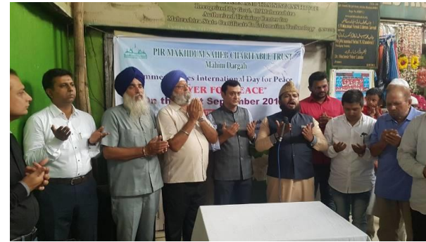
Prayers for Peace @ Mumbai