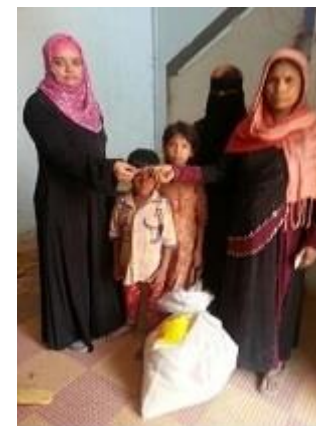
Monthly Rations for a Destitute Refugee Family