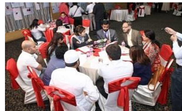
A TechCamp Session

For more information please visit the dedicated website of COFI Networks at: www.cofinetworks.org