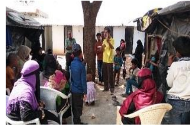
Community Interaction in Progress