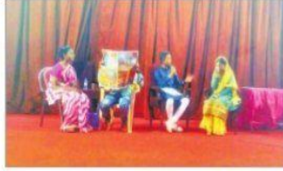
నాటకం ప్రదర్శిస్తున్న విద్యార్థులు

: ప్రపంచ శాంతి, మత సామరస్యం, నద్వావా నపై అవగాహన కల్పించేందుకు కోవా సంస్థ ఆధ్వర్యంలో జంట నగరాల విద్యార్థులకు ఆయా