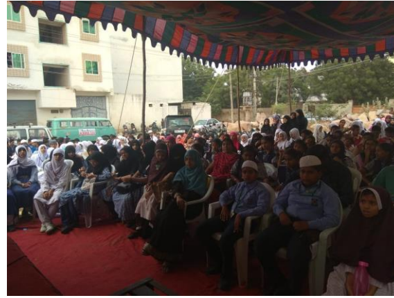
View of the gathering at the Valedictory Session.