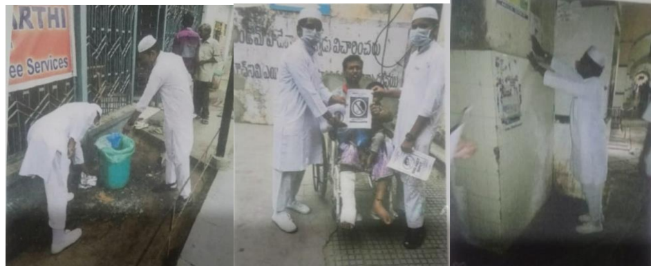
Students cleaning premises of Osmania General Hospital and spreading awareness about Hygiene to patients through Posters.

They began with buying a couple of face masks, some bleaching powder, some floor cleaner, and dustbins. They picked up the trash in some of the common areas, cleaned the floors, put some disinfectant and put up dustbins in the area for the public to use. In order to bring in the behavioral change, they made posters on not spitting and keeping the surroundings clean and put up in the areas where there was a lot of littering and spitting. Later, they tied a couple of ropes at places that were prone to crowding to make sure people follow a Queue. The students are visiting the hospital once every week and repeat the same.