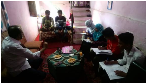
SAP Participants at their Field Work Taking House Hold Surveys

COVA organised an Intensive Summer Activism Program on understanding social issues and learning techniques for effective advocacy for the students who won prizes at the 14th Project Works Display in December 2018. In all 25 prize-winning students were selected for participating in this Special Summer Training Program from 14 th April to 15 th May 2019. The group of Students were from TMRIES [Telangana Minorities Residential School], MS Future School, Gyan Educational Academy, Zehra Free High School, and St. Stephen High School. The students were divided into 2 teams and they worked on Water Conservation and Lavish Weddings, and as part of the field visit, students took a survey in Kishanbagh, Doodhbowli, and Malakpet. After the survey, they found that people are facing different problems.