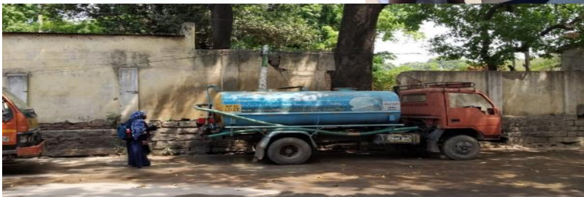
SAP Participants at their Field Work to Check if the Water is Getting Wasted while Filling Water Tanks

15 days of the program were devoted to understanding issues and field visits and 15 days to undertake advocacy with elected representatives and officials including Ministers, MPs, MLAs. Corporators, Bureaucrats, Media, Community Leaders, Religious Leaders and Thought Leaders to understand and address the problems under Study.