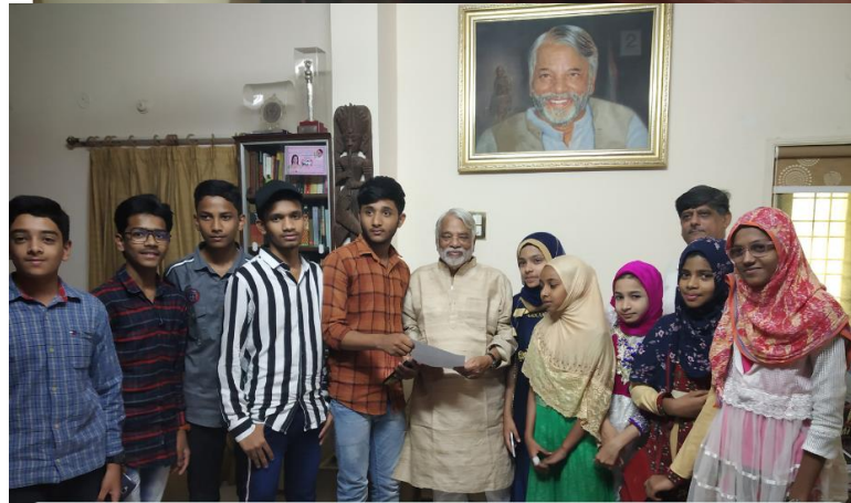
SAP PARTICIPANTS SUBMITTING REPRESENTATION TO MR. K. KESHA VA RAO, MP, RAJYA SABHA