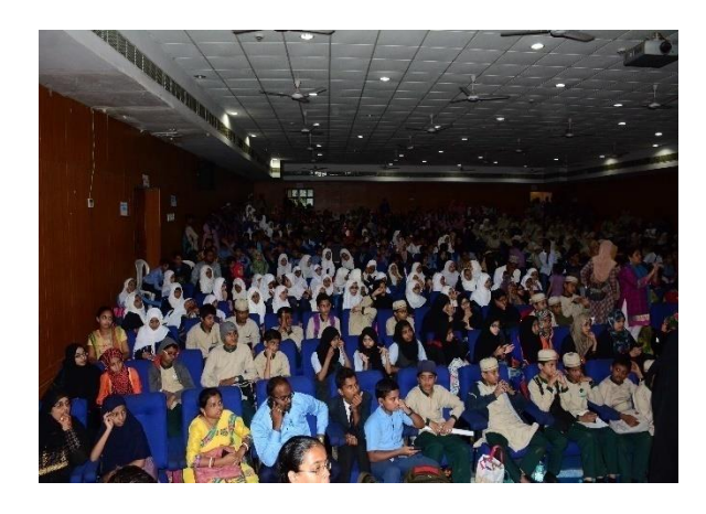
View of the Audience at the Valedictory