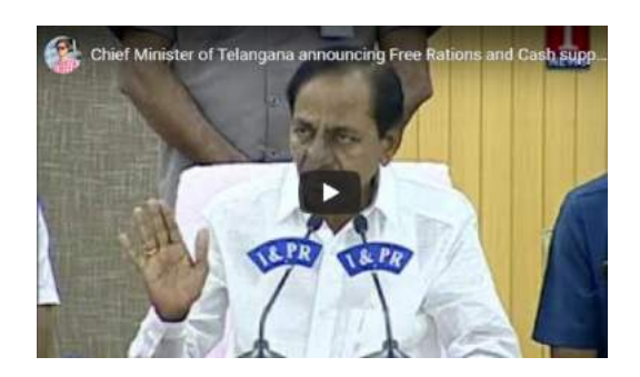
Chief Minister of Telangana announcing Free Rations for Migrant Workers!

With the Lockdown, the Migrants were not getting their weekly wages and with their meagre savings depleted, they were on the verge of starvation. On COVA's representation, the Government of Telangana announced on 29<sup>th</sup> March 2019 that free rations would be provided to all the migrant workers in the State through Government Ration Shops along with Rs. 500 in cash for sundry expenses. Over 3.5 Lakh migrant workers benefited from this scheme for two months.