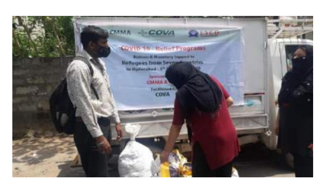
Distribution of Ration Kits for COVID-19 Relief