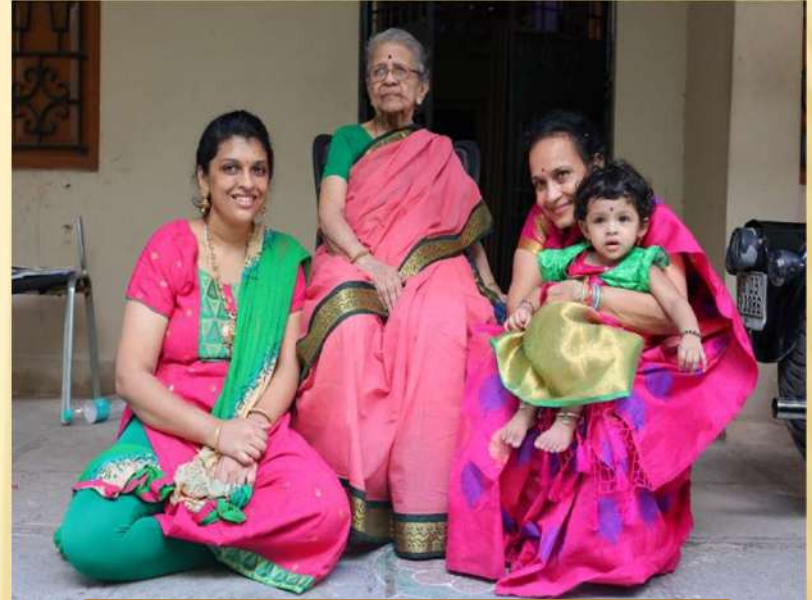
Four Generations Living Together!