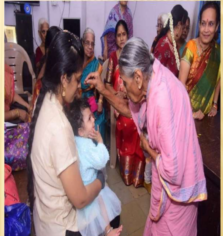
Celebrating Birthday of a Child at an Old Age Home