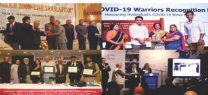
Awards for COVA & Partners: State- National - South Asia - International