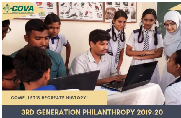
3RD GENERATION PHILANTHROPY 2019-20