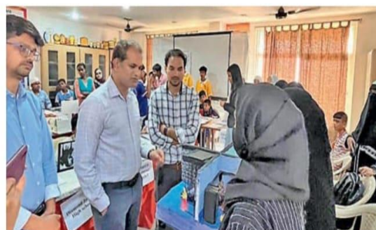
COVA Peace Network students showcase their projects at a programme on Saturday.