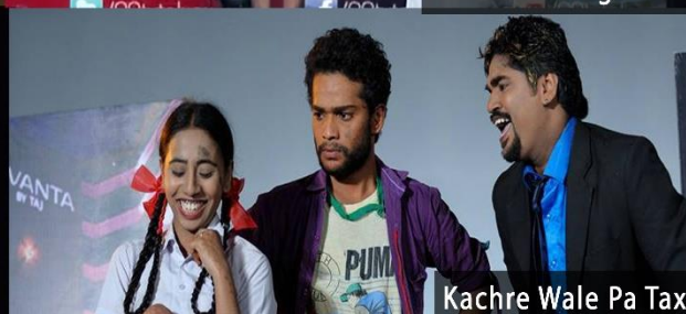
Kachre Wale Pa Tax