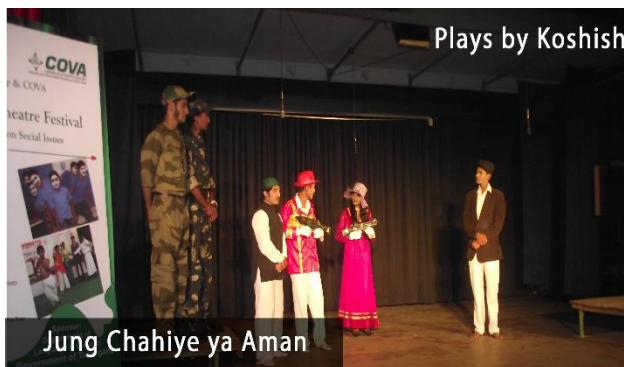
Jung Chahiye ya Aman