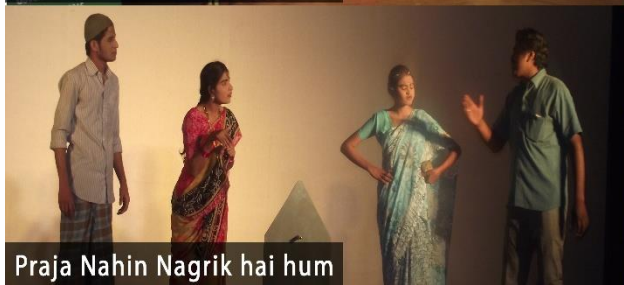
Praja Nahin Nagrik hai hum