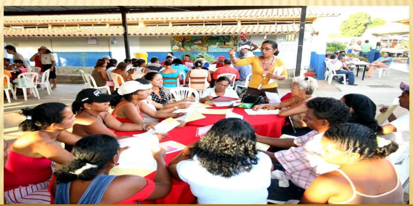
A Participatory Budget Session in Progress in Brazil

Participatory Budgeting (PB) is a democratic process in which community members decide how to spend part of a public budget. It gives people real power over real money. The participatory budgeting was originated in Porto Alegre, Brazil in 1989 as an antipoverty measure.